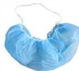
Ref. A00282 Blue