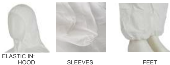
ELASTIC IN: HOOD